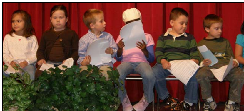
First grade students prepare for their PTA performance.